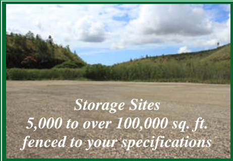
Storage Sites 5,000 to over 100,000 sq. ft. fenced to your specifications