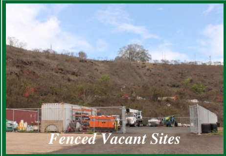
Fenced Vacant Sites