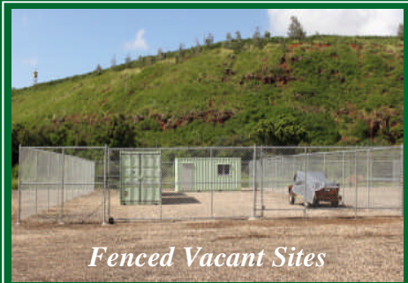
Fenced Vacant Sites